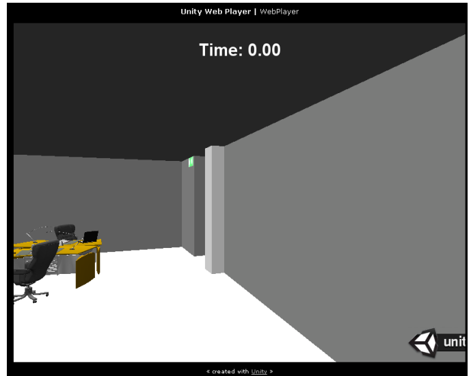
Figure 2. 3D rendered view of the building

The player starts in a predefined room and, upon starting the evacuation event, a fire appears in a random room, forcing the alarm to ring. At this moment, the timer starts and the player must then traverse the building in order to go outside as quickly as possible, choosing from one of the two possible exits. Several emergency signs are in place so as to help the player to identify the nearest exit to his/her current spot.